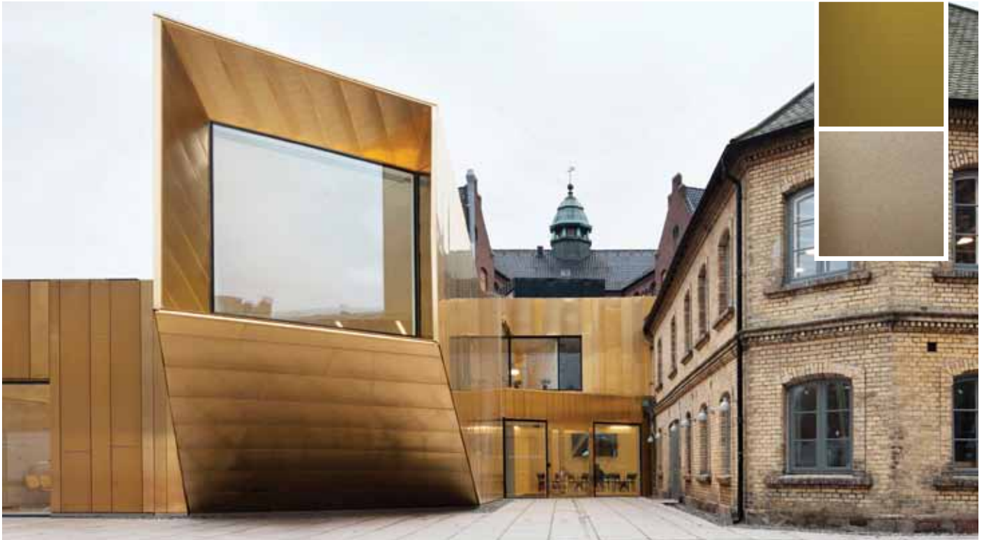
Lund Cathedral Visitor Centre, Sweden; Architect: Carmen Izquierdo.