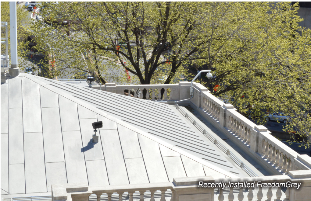
Recently Installed FreedomGrey